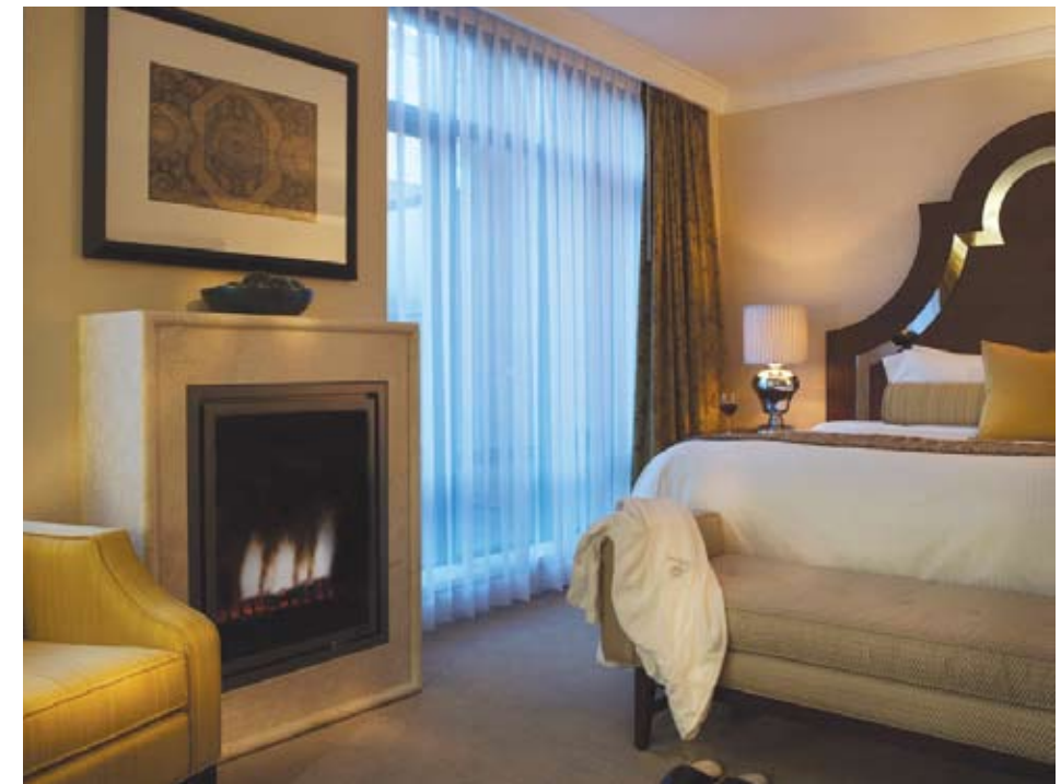
Opposite: Participants in the Beluga Encounter programs get some "face time" with these amazing creatures at the Vancouver Aquarium. Above: After a day filled with marine mammal adventures, consider switching gears with a stylish urban experience at L'Hermitage, Vancouver's newest boutique hotel. Enjoy hors d'oeuvres in the atrium lounge, and then tuck yourself into a plush king-sized bed in one of the hotel's 60 luxurious rooms.

complimentary European-style continental breakfast as well as hors d'oeuvres later in the afternoon. These delectable foods — including rosemary-scented ham, savoury tarts, artisan breads and seasonal fruits — are locally sourced. A food and beverage menu is also available here from 2 PM until 9 PM, with this spacious, relaxing room favouring a soundtrack of non-commercial jazz from the personal collection of the concierge. Visitors agree that L'Hermitage, with its knack for offering classic comfort with a modern twist, represents an unforgettable getaway. So if you come to Vancouver for an adventure with animals, don't forget about the creature comforts that await you at the city's newest adventure in luxury.